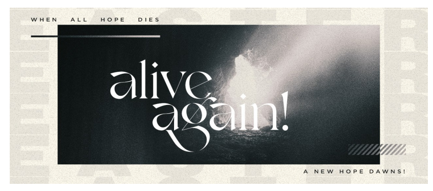
When All Hope Dies April 9 & 10, 2022