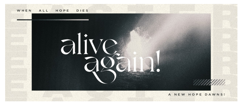
When All Hope Dies April 9 & 10, 2022